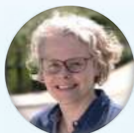
Prof Audrey Moores McGill University

The conference will feature short courses, keynote lectures and panel discussions from leading experts: